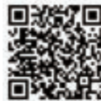
Google home tutorial